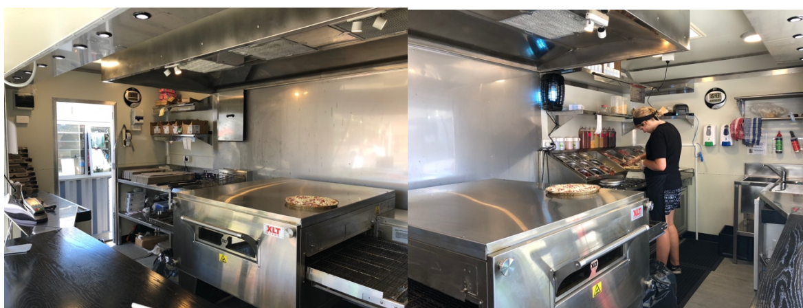
Shots of the caravan interior